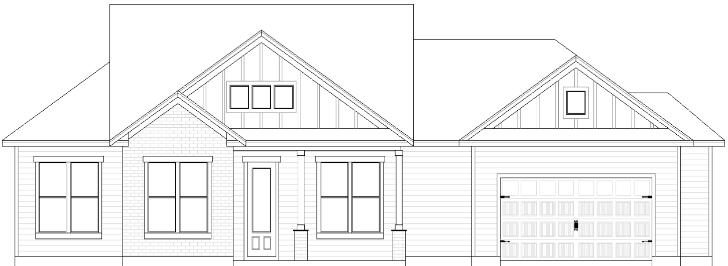
FRONT ELEVATION EXAMPLE 2

CALL (352)332-3912 TODAY TO START BUILDING YOUR DREAM HOME!